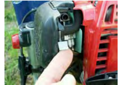
Fig. 15 Putting choke in position " Choke "