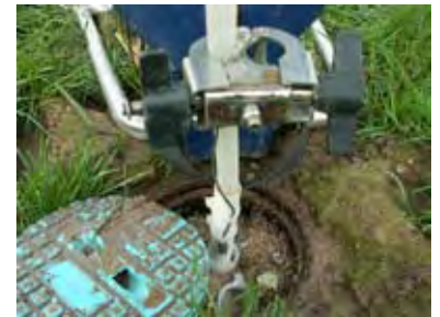
Fig. 8 Use of the tube guide