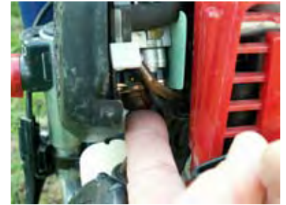
Fig. 14 Push the clear rubber bulb