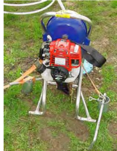
Fig. 7 Two anchors are used to install the actuator