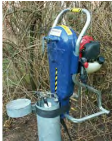
Fig. 3 Strap fixed around casing