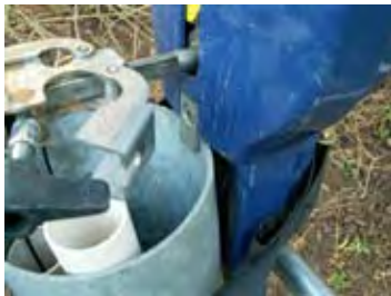
Fig. 2 Actuator hooked on the upper rim