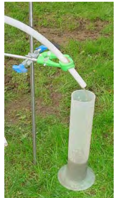
Fig. 16 Measuring the flow