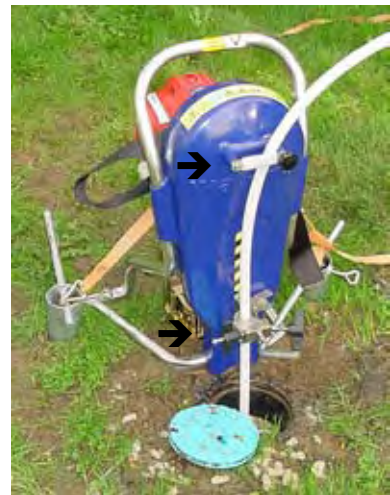
Fig. 12 Tubing fixed in upper and lower tube guide