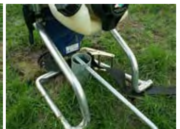
Fig. 4 One central ground anchor installed under the engine