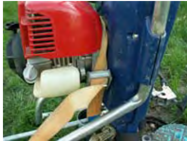
Fig. 6 Pull strap between engine and crankcase