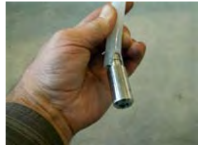
Fig. 11 Removing a valve