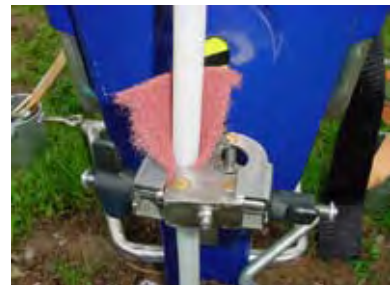
Fig. 13 Piece of scouring pad around tube