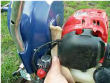
Fig. 5 Pass strap behind electric cables

Do not allow any movement of the actuator during operation.