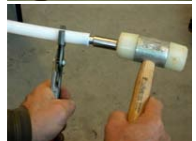
Fig. 10 Mounting a valve