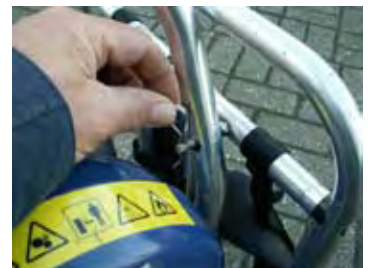
Fig. 1 Removal of carrying frame